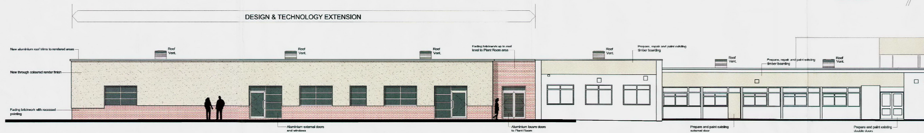
PROPOSED WEST ELEVATION (showing Design and Technology Extension)